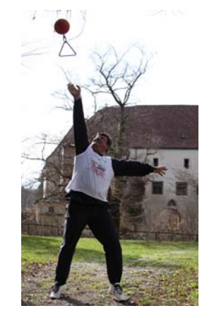
Weight – High toss 25,4 kg