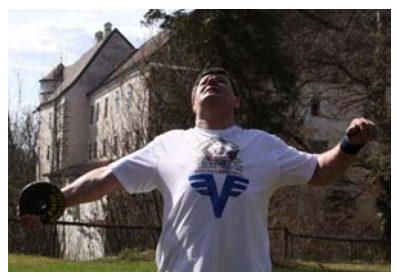
Discus Greek Style 5 kg