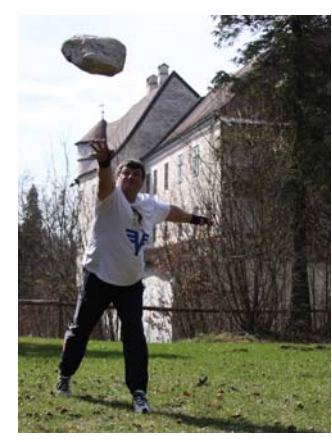
Stone-put - 25 kg